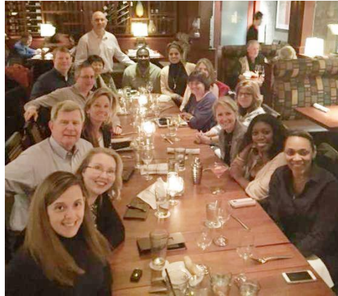
Members of LJ 2014 met in November for their third annual class dinner.