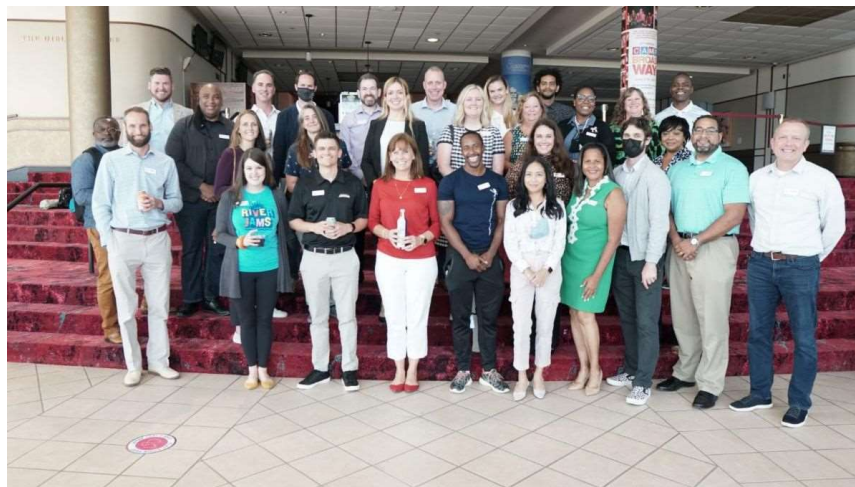
LJ 2021 Class at the Times-Union Center for Performing Arts