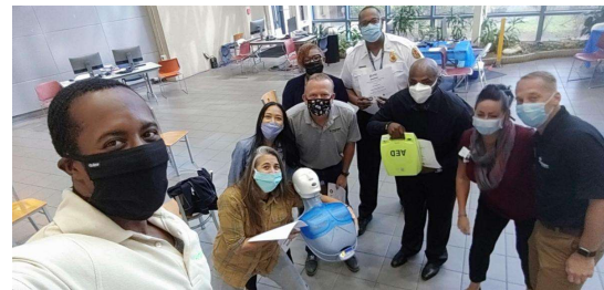
LJ 2021 class members at UF Health

Thank you to our Program Day Sponsor, PNC Bank and to The Douglas Anderson School of the Arts Foundation (reception sponsor).