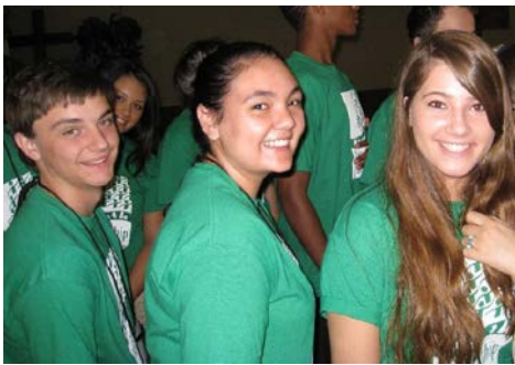
YLJ Green Team ready for action!

The 58 students in YLJ XXIV were treated to a full day of team-building and learning activities focused on communications and appreciating differences during their Opening Retreat on Saturday, September 7 at Hendricks Avenue Baptist Church.