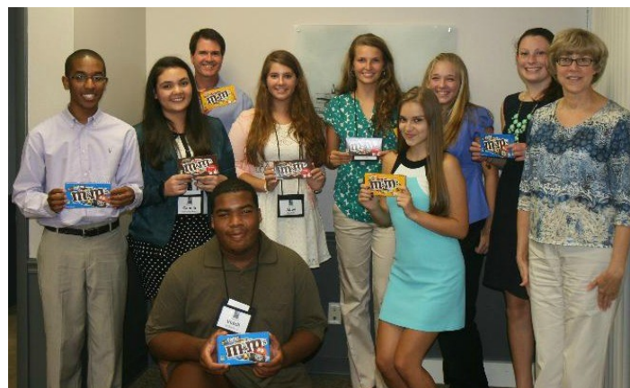
Youth Leadership Jacksonville Class XXIV enjoyed a fun-filled Opening Dinner on August 25, 2013.