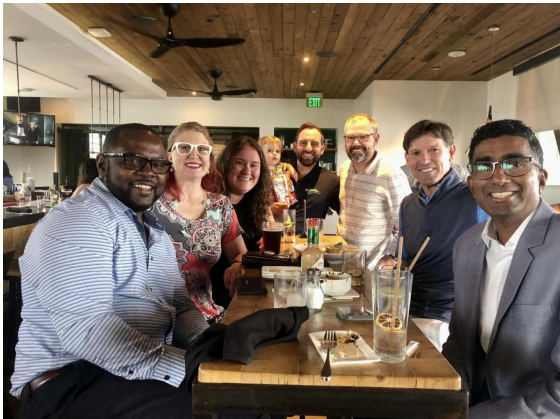
LJ 2020 got together for a class social at Prati