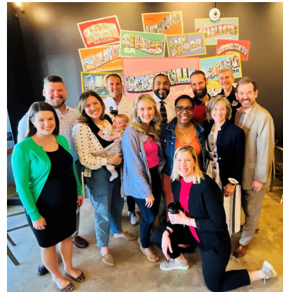
LJ 2021 enjoyed a class social at Bitty and