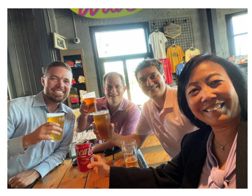
LJ 2019 enjoyed Happy Hour on August 24 at Intuition Ale Works.