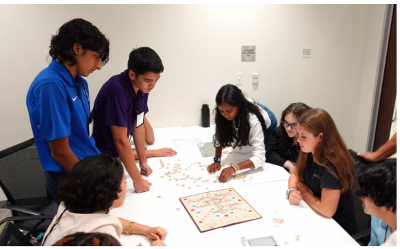
The YLJ 2024 Opening Retreat brought together a diverse group of high school sophomore students on August 25-26, which included team building activities that fostered creativity and collaboration. Participants enjoyed discussions on a variety of community issues facilitated by NextGen and LJ Alumni volunteers.