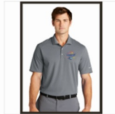
Leadership Jacksonville Nike Performance Polo From $55.00