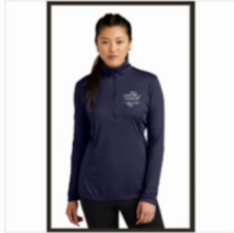
Leadership Jacksonville Ladies Performance 1/4 Zip From $32.50