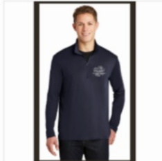
Leadership Jacksonville Performance 1/4 Zip From $32.50